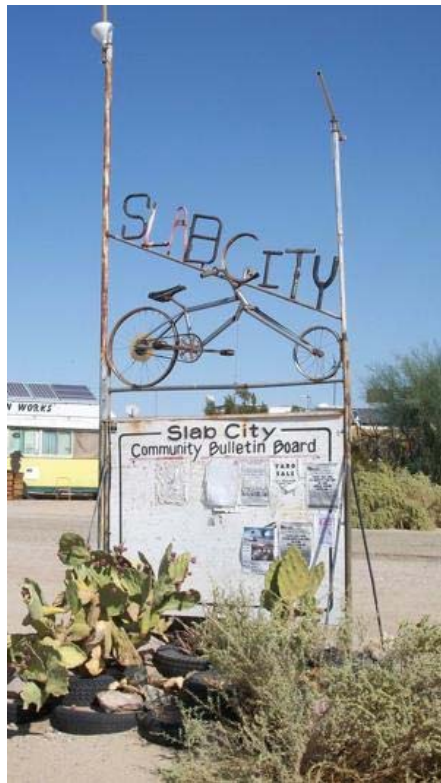
Slab City sign, just a hint of the folk art you'll find.

There is enough folk art to fill two metropolitan museums.